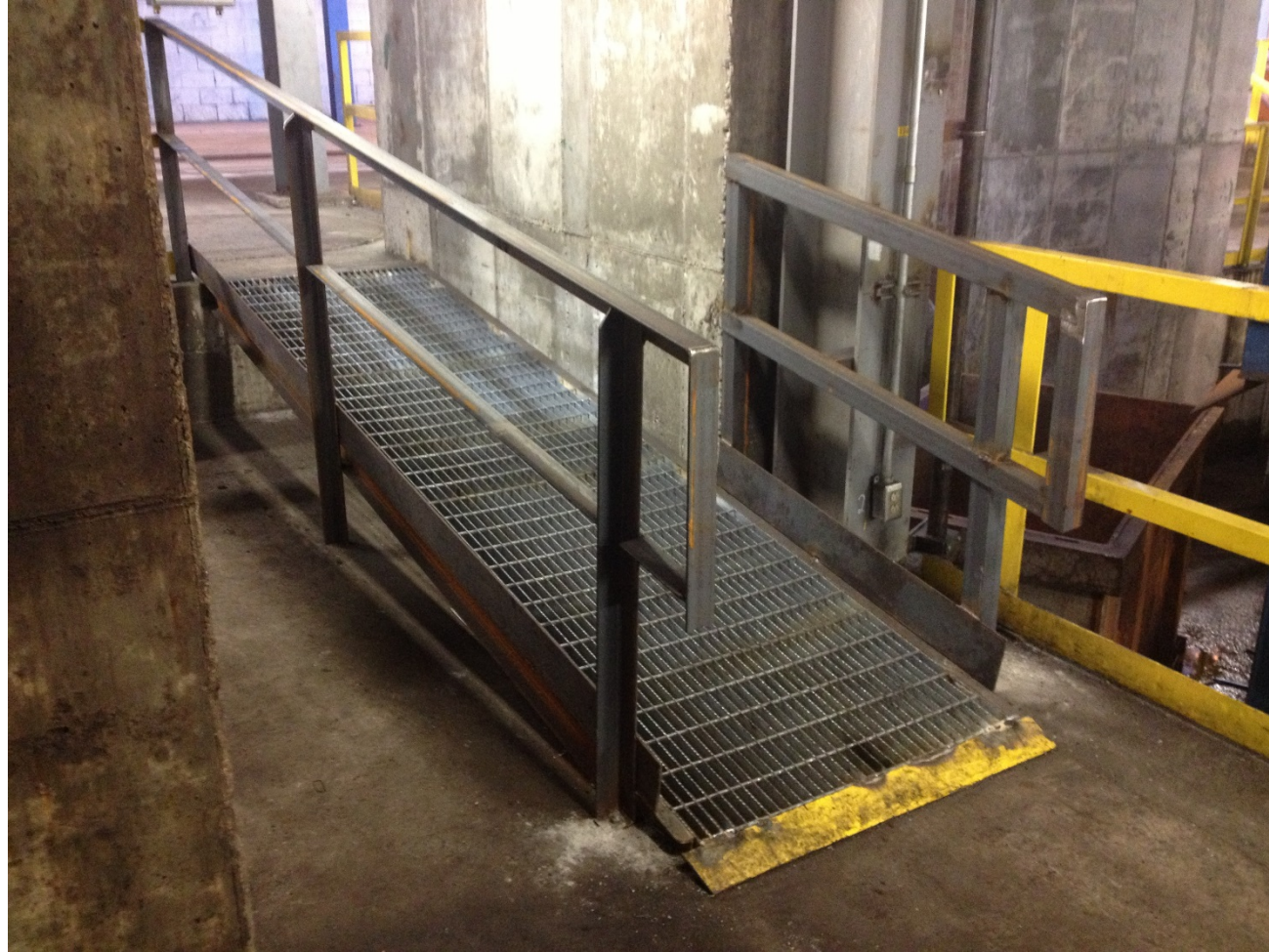
Bar Mill 1 Short Path Ramp