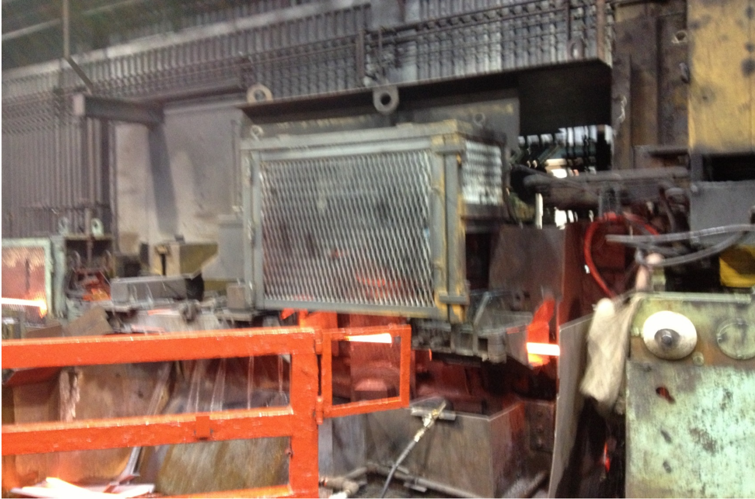
BM1 Shear 2 (Optimization Shear) Cover