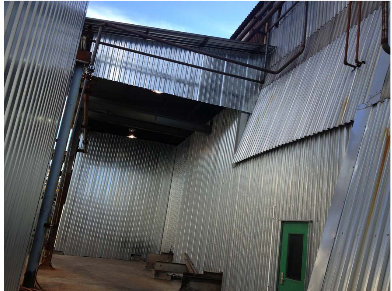
Walls and Doors (before & after)